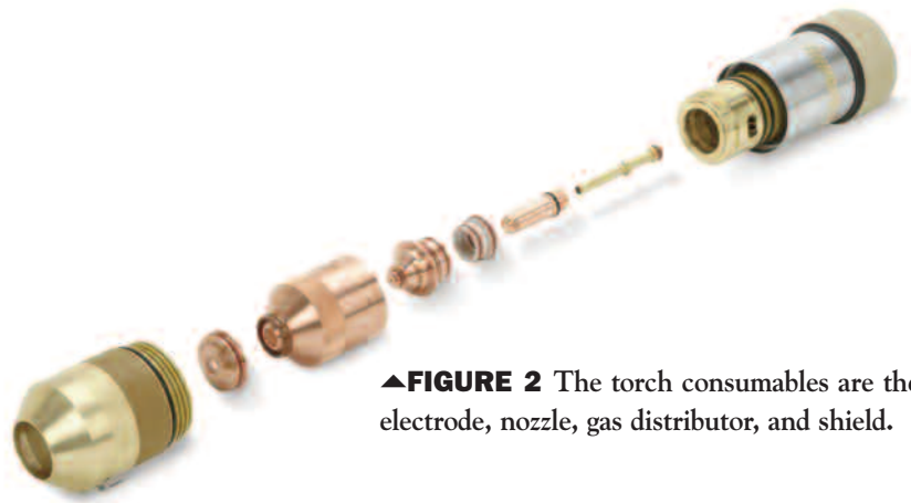
▲ FIGURE 2 The torch consumables are the electrode, nozzle, gas distributor, and shield.

Electrodes. Electrode failure occurs when the emitting element has worn back so deeply that the arc begins to emit off of the surrounding copper or silver casing. This may also damage the nozzle orifice. Improper gas flow and coolant leaks cause an electrode to fail prematurely.